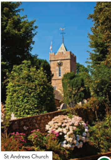
St Andrews Church