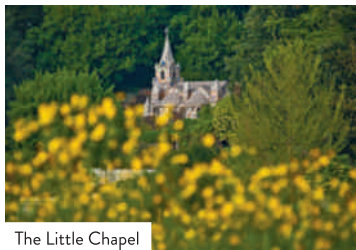
The Little Chapel