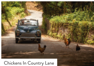
Chickens In Country Lane